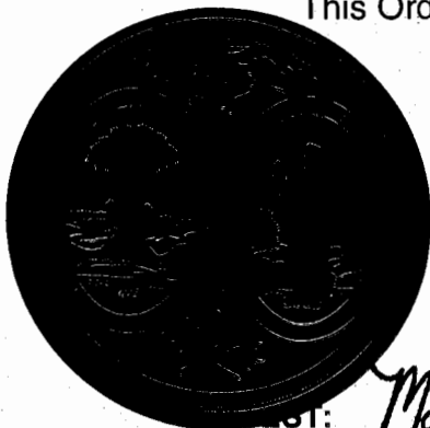
MARK SANEORD Governor